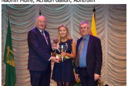
AMHRÁNAÍOCHT AONAIR: ULAIDH Cumann Chluain Daimh, An Dún