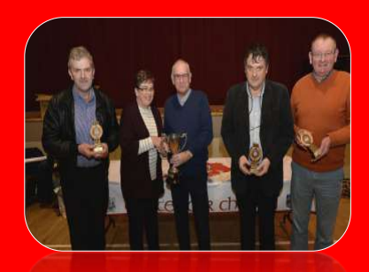
MILLSTREET in the Tráth na gCeisteanna Boird