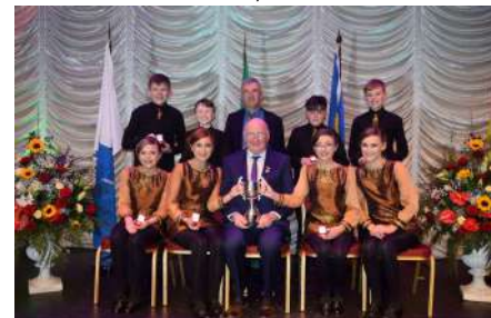
RINCE SEIT: CONNACHTA Mainistir Chnoc Muaidhe, Gaillimh