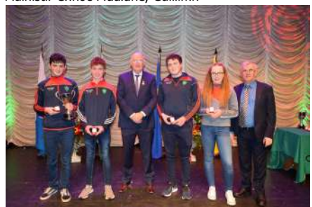
TRÁTH NA GCEISTEANNA BOIRD: ULAIDH Corr na Féinne, an Cabhán