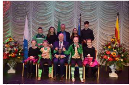
LÉIRIÚ: ULAIDH Naomh Muire, Achadh Gallon, Aontroim