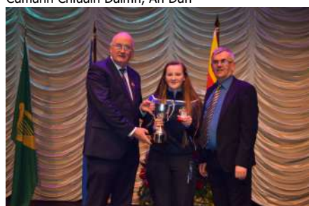
AITHRISEOIREACHT/SCÉALAÍOCHT: ULAIDH Tír na nÓg Baile Raghnall, Aontroim