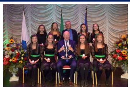
RINCE FOIRNE: ULAIDH Naomh Muire, Achadh Gallon, Aontroim