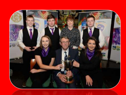
KILSHANNIG in Ceol Uirlise